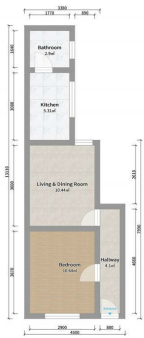
St Stephens Ground Floor